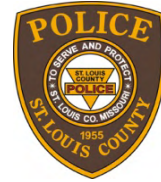
St. Louis County Precincts