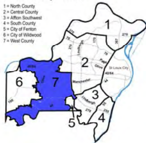
St. Louis County Precincts