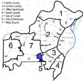
St. Louis County Precincts