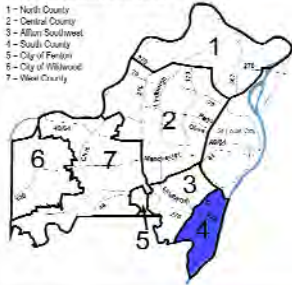
St. Louis County Precincts