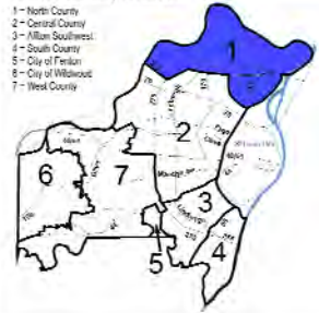
St. Louis County Precincts