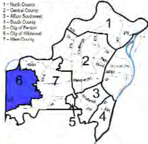
St. Louis County Precincts