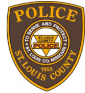
St. Louis County Precincts