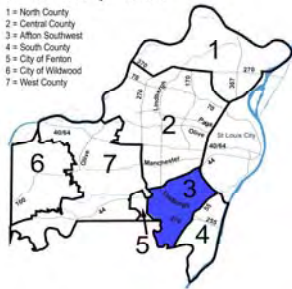
St. Louis County Precincts