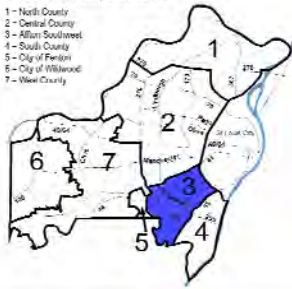
St. Louis County Precincts